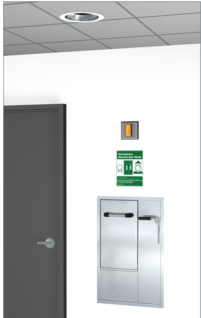
Note: Shown with optional AP280-230 electric light and alarm horn unit (sold separately).